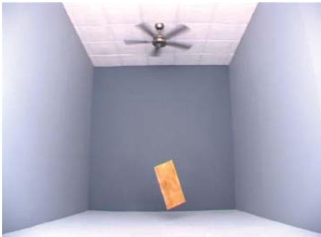
100m 2004 MiniDV, 3 mins. 52 secs.

Wood and Harrison came to prominence in 2000 when they were selected for "British Art Show 5," which showcased the latest movements in British art. Since then, they have been startlingly busy, including solo exhibitions at MoMA QNS in New York and at Tate Britain in London in 2004. MAM Project 005 is their keenly-awaited first major exhibition in Japan, and presents new works created specifically for the occasion as well as other recent works. The 'records of experiments' they exhibit at the Mori Art Museum will make visitors smile, bringing back memories of the excitement we felt as children when our own experiments were successful.